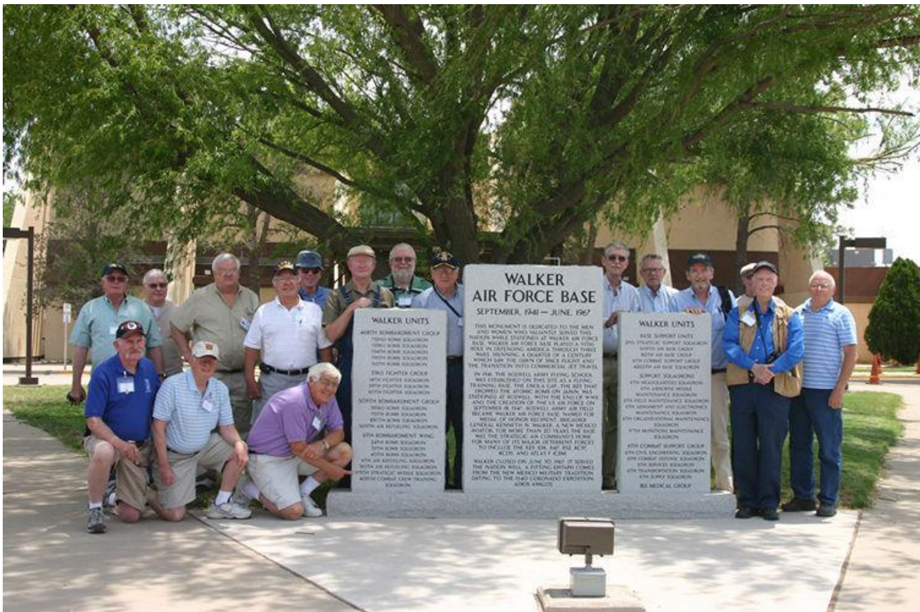
579 th Members gather at the Walker AFB Monument at the Walker Aviation Museum (and Air Terminal)