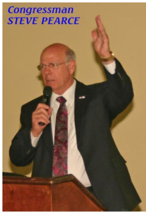
Congressman STEVE PEARCE