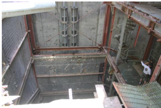
Silo at Site 10