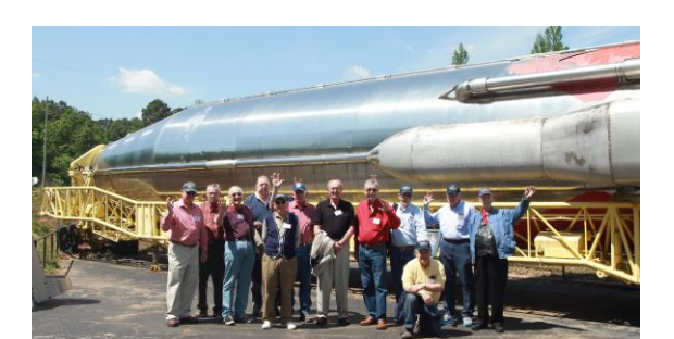
Look what we found in Huntsville!! and YES it is an Atlas-F!!

Squadron patches (exact duplicate from the original) very limited qty $5.00